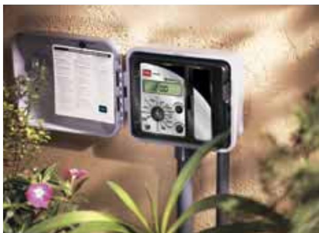
1 Simply enter site-specific conditions upon installation of unit.