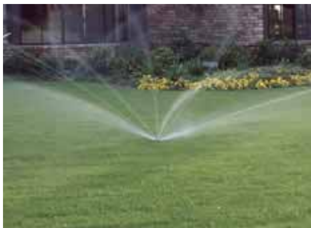
3 Irrigation schedules are adjusted accordingly and precise water amounts are delivered automatically.