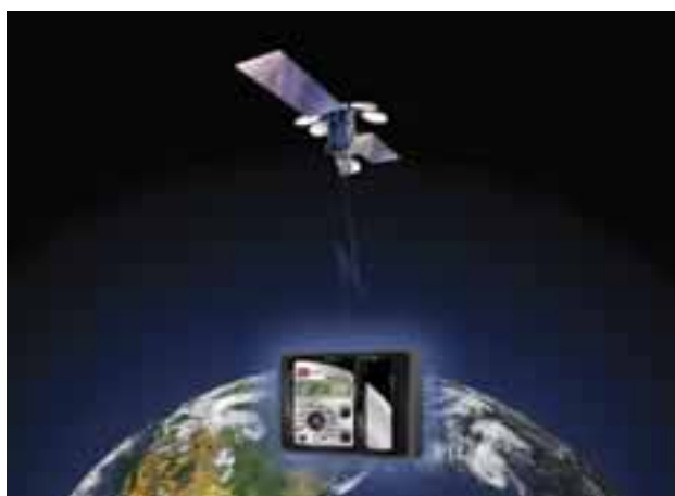
2 Information gathered from weather stations is transmitted through satellites to the Intelli-Sense controller.